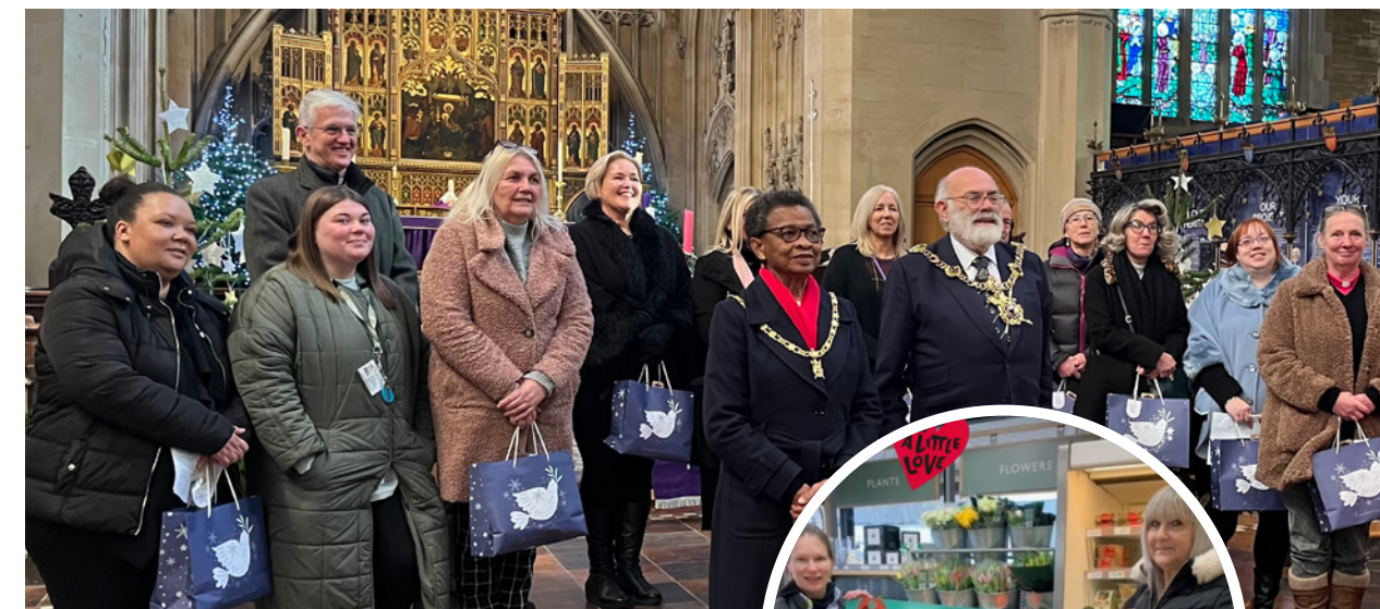
Above: The Portsmouth Diocese donated gift vouchers for clients Right: Waitrose chose to support our New Forest refuge